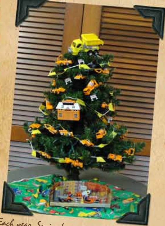
Each year, Suzio decorates a construction-themed Christmas tree for a local charity auction.